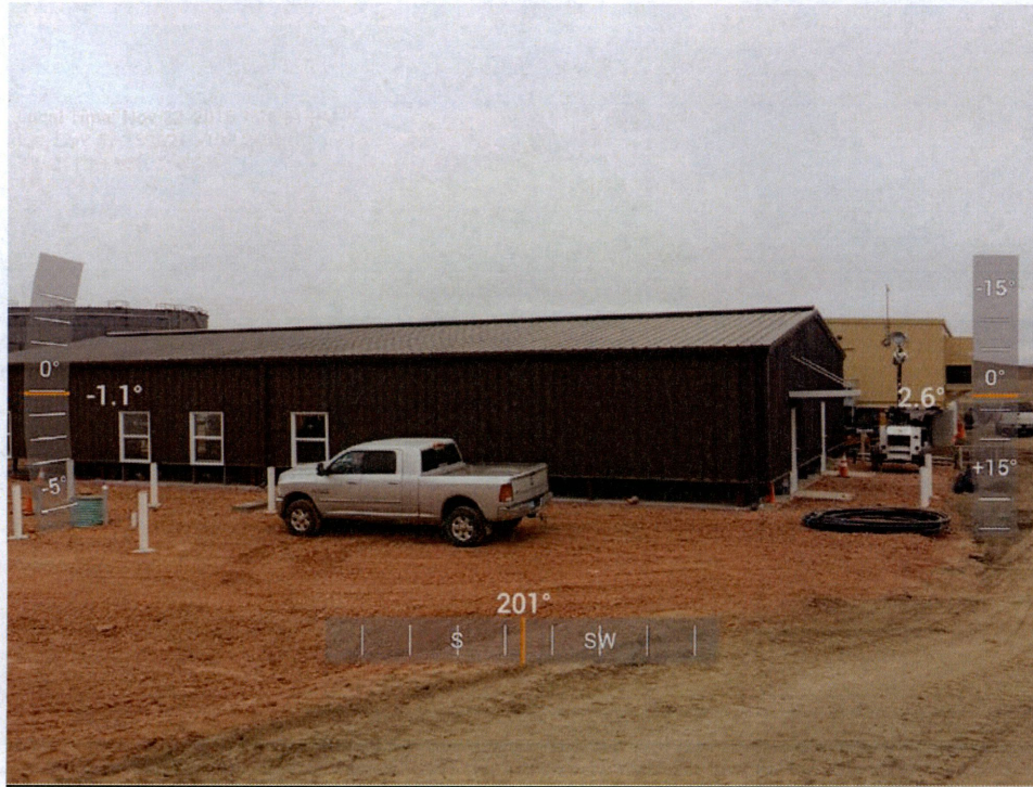
Project Map Inspection Location: